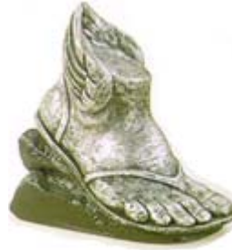
2005 age group award